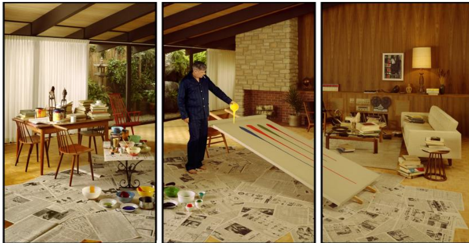
The Gifted Amateur, Nov.10th, 1962, 2007 three transmounted chromogenic transparencies in painted aluminum light boxes each: 112 1/2 x 72 x 7 in (285.7 x 182.9 x 17.8 cm) overall: 112 1/2 x 219 x 7 in (285.7 x 555.3 x 17.8 cm)