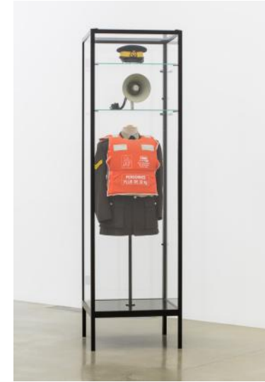
Loudhailer Vitrine (Wicker Man), 2003 steel, glass, wood, tailor's dummy, uniform jacket, life vest, hat, megaphone 99 5/8 x 32 5/8 x 32 1/2 in (253 x 82.9 x 82.5 cm)