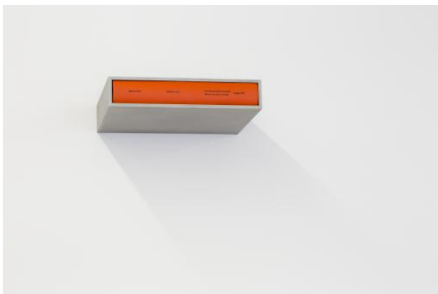
Donald Judd (Catalogue Raisonné, The National Gallery of Canada), 1994 anodized aluminum with book 2 3/8 x 12 x 9 5/8 in (6 x 30.5 x 24.4 cm)