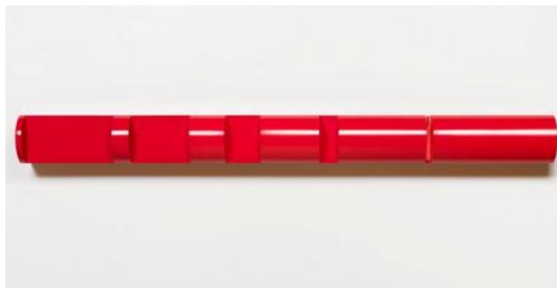
Introductory Lectures, 1988 wood, red lacquer, book 8 3/4 x 91 1/4 x 8 3/4 in (22.2 x 231.8 x 22.2 cm)