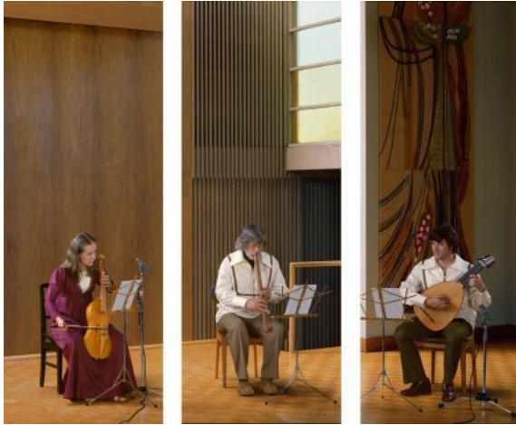
3 Musicians (Members of the Early Music Group "Renaissance Fare" performing Matteo of Perugia's 'le Greygnour Bien' at the Unitarian Church of Vancouver, Late September, 1977), 2006 three transmounted chromogenic transparencies in painted aluminum light boxes each: 120 5/8 x 46 1/2 x 7 in (306.4 x 118 x 17.8 cm) overall: 120 5/8 x 148 x 7 in (306.4 x 375.9 x 17.8 cm)