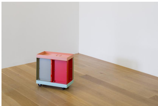
Dr. Seuss' Sleep Book: Child's Table / Trolley, 1993 painted steel, castor, book 16 1/2 x 16 7/8 x 8 1/4 in (42 x 43 x 21 cm)