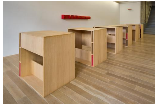
Concordance to the Standard Edition: Six Reference Desks in Oak, 1993 six units in medite laminated in oak, six books each: 40 x 40 x 29 1/2 in (101.6 x 101.6 x 74.9 cm)