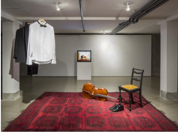
Two Movements for Prepared Cello, 2010 cello, chair, carpet, vitrine, two cufflinks, pair of shoes, shirt, black suit, bow tie, film, score, sound dimensions variable