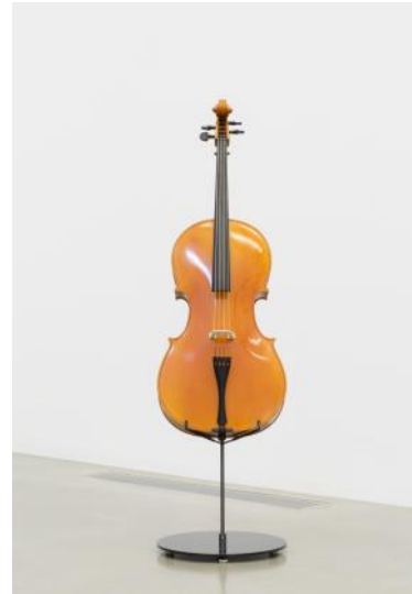
Large Rattle, 2012 cello, silver cufflinks, rug, cello stand 51 1/8 x 17 1/4 x 11 5/16 in (130 x 45 x 30 cm)