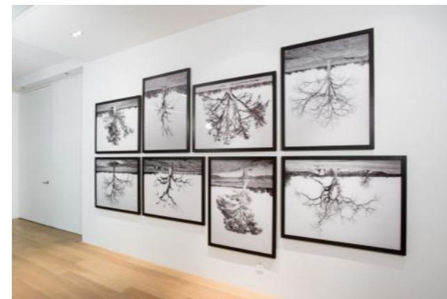
Oak Tree Red Bluff (1-8), 1993/2000 eight black and white photographs each, framed: 32 3/8 x 41 3/8 in (82.2 x 105.1 cm)