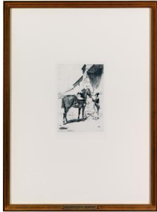
Meissonnier with my thumb-print, 2009 photogravure printed in dark blue ink on Hahnemuhle bright white paper, black frame with affixed brass plaque inscribed "Meissonnier with my thumb print. R. Graham" framed: 21 3/4 x 16 1/2 in (55.2 x 41.9 cm)