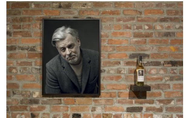
Old Softy, 2013 Single malt Scotch whisky aged 21 years distilled at Auchentoshan distillery, digital pigment print, hand embossed and varnished tear print: 30 1/8 x 22 1/2 in (76.5 x 57.2 cm)