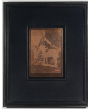
Meissonnier with my thumb-print, 2009 copper plate framed: 17 1/8 x 14 in (43.5 x 35.6 cm)