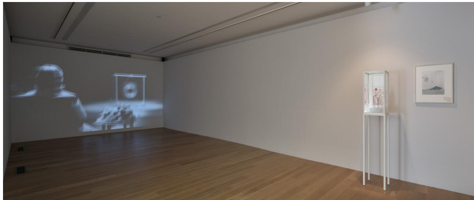
Lobbing Potatoes at a Gong, 2006 super 16mm film, 4:20 minutes, continuous loop; digital stereo sound, Super 16 xenon projector with looper, amplifier, two speakers, one sub-woofer, Synch electronics, bottle of potato vodka in vitrine, two paintings, print 4:20 minutes, continuous loop painting: 61 x 61 in (154.9 x 154.9 cm) print: 22 x 17 3/4 x 1 1/2 in (55.9 x 45.1 x 3.8 cm) framed