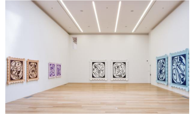
Possible Abstractions, 2010 polyurethane on wood and acrylic polymer 2 lrg pairs of panels: 96 x 84 3/4 x 5 3/4 in (243.8 x 215.3 x 14.6 cm) each 4 sm pairs of panels: 51 1/4 x 45 1/4 x 3 in (130.2 x 115 x 7.6 cm) each