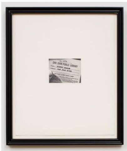
Film Still from 'Mr. Moto in Danger Island' (1939), 2013 photogravure print on Hahnemuhle paper framed: 14 1/2 x 12 in (36.8 x 30.5 cm)