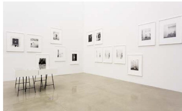
Pictures for an Exhibition , 2013-2014 Set of 36 laser exposed silver gelatin prints, 2 vitrines, 2 modified Deardorff 8 x 10 field cameras, film holders, tripods and historical photographs Prints, framed, each: 35 7/16 x 45 1/4 inches (90 x 115 cm) Vitrine, each: 7 7/8 x 55 1/8 x 29 1/2 inches (20 x 140 x 75 cm)