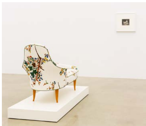
Weeding Aralia (Chaise Lounge), 2007 chaise lounge by Kerstin Horlin-Holmquist (circa 1958), Aralia fabric by Josef Frank (1947) with silkscreen overprinting Chaise: 46 x 63 1/4 x 36 in (116.8 x 160.7 x 91.4 cm)