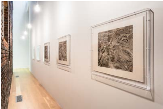
One Ton, II 5 handmade platinum/palladium prints of the Anglo American Platinum Corporation mine at Potgieterus, South Africa, produced using as many platinum group metal salts as can be derived from one ton of ore, 2005 5 unique platinum/palladium prints framed in acrylic boxes Each, framed: 33 1/2 x 25 5/8 in (85.1 x 65.1 cm)