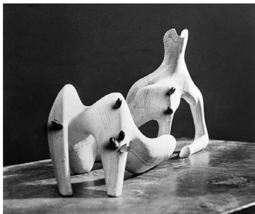
Musselled Moore (Reclining Figure, 1950), 2008 silver gelatin print Photo, framed: 18 3/4 x 20 1/4 x 1 1/2 in (47.6 x 51.4 x 3.8 cm)