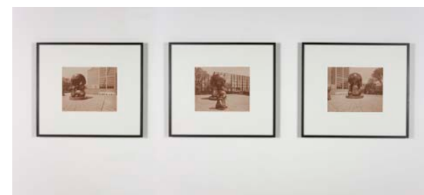
Project for a Meeting (Chicago), 2010 3 chryso-urano prints Each, framed: 20 x 16 in (50.8 x 40.6 cm)