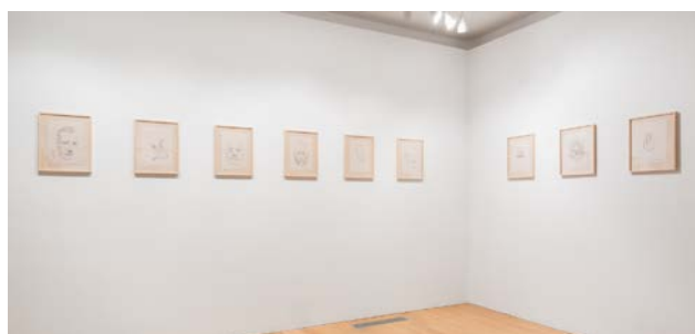
Project for a Masquerade (Hiroshima)/Designs for Nine Masks, 2010 9 drawings, graphite on tracing paper Each, framed: 11 3/4 x 8 1/4 in (29.9 x 21 cm)