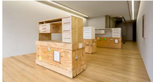
Three White Desks , 2008-2009 3 wooden desks, 3 crates, print Desk 1: 30 5/16 x 89 x 24 9/16 in (77 x 226.1 x 62.4 cm) Desk 2: 29 1/2 x 70 7/8 x 23 5/8 in (74.9 x 180 x 60 cm) Desk 3: 28 3/4 x 58 1/16 x 25 7/8 in (73 x 147.5 x 65.7 cm) Print, framed: 35 1/4 x 25 9/16 in (89.5 x 64.9 cm)