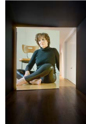
El Eco , 2014 35 mm film transferred to HD Duration: 11 min. 18 sec. (loop) Projected dimensions variable