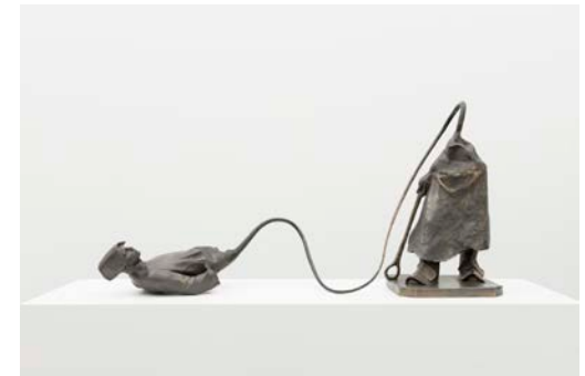
Extruded Smith (after The Hammerman) , 2014 blacksmith's bronze Sculpture: 37 3/16 x 76 7/8 x 24 1/16 in (94.5 x 195.3 x 61.1 cm)