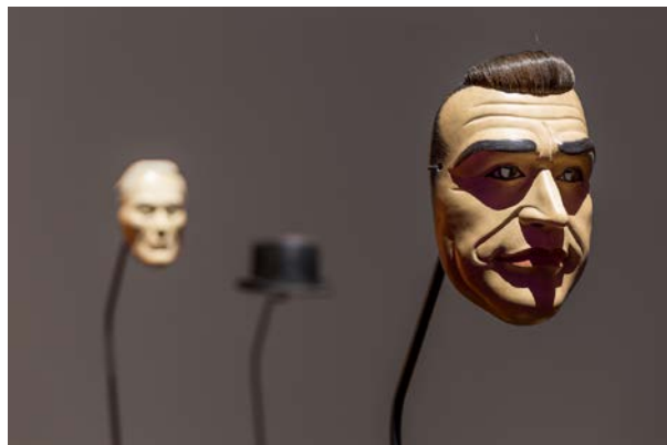
Project for a Masquerade (Hiroshima), 2010-11 In collaboration with Yasuo Miichi, Osaka 16 mm film transferred to digital (25 minutes, 45 seconds), 8 wooden masks and bowler hat, metal stands, suspended screen/mirror, HD projector, media player, and speakers dimensions variable